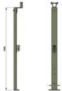
post and bracket