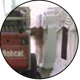
stay open when in use