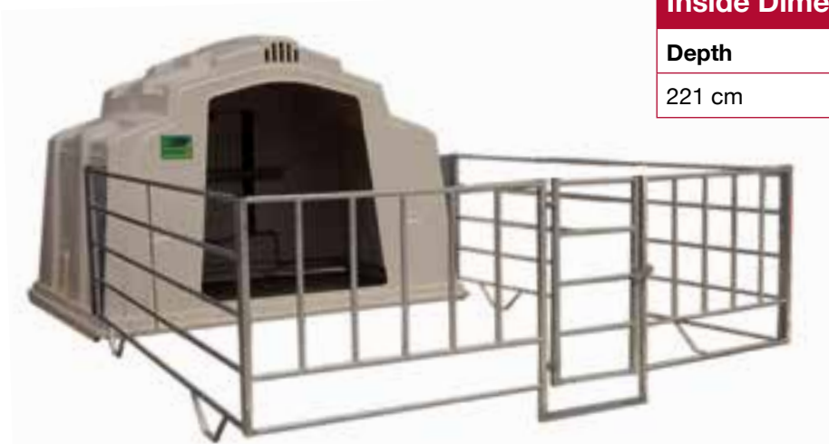
group hutch & fence kit