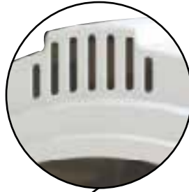
front ridge ventilation