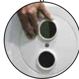
two adjustable air flow vents at bottom