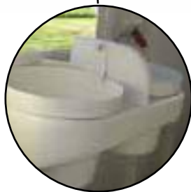
bucket holder & 2 buckets inside