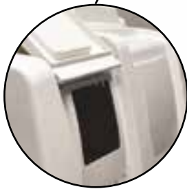
stay open door locks into place